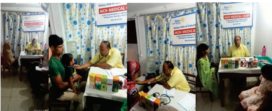
Free weekly Medical Camp at RCC Sukantapally United Samity, Subhashgram, Baruipur, W.B. 219 Patients were examined during the month